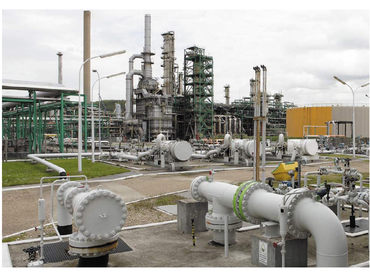
Gonfreville pumping station