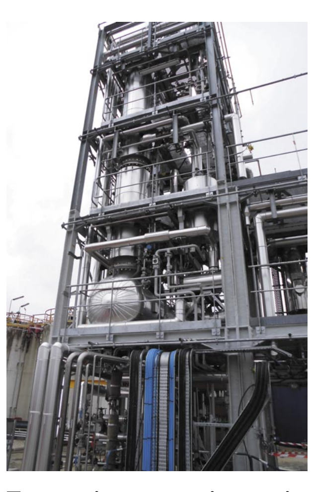
Transmix processing unit