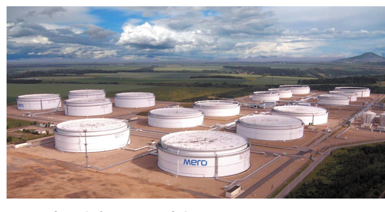
Central tank farm at Nelahozeves